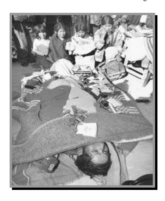
Bolivians grieve the deaths of rural people in the gas conflict.