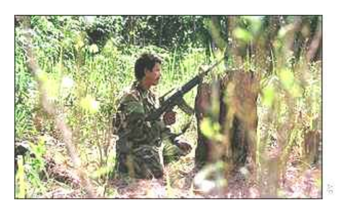
Armed paramilitary in the conflict zone

There are numerous members of indigenous and afro-Columbian communities living in zones of great economic and strategic interest who have been threatened with death or forced to leave their homes simply for defending the conservation of the biodiversity in the region, which is being threatened by the exploitation of native woodland and the extraction of natural resources. On 26<sup>th</sup> April 2003, The Revolutionary Forces of Columbia (FARC) assassinated banana plantation workers in the municipality of Apartado in Antioquía. It should also be added that there were constant armed raids during 2003, in which the following all disappeared against their will: José Mora Pinzón, Noelia García Aguirre, Arturo Pedreros, Luis Alejandro izquierdo Medin, Ferney Céspedes Vanegas, José Salamanca Pinzón, Hernando Mican and Wilson Duarte. Rural workers Antolín Viracachá and Edgar Rubio were murdered in the same way.<sup>37</sup>