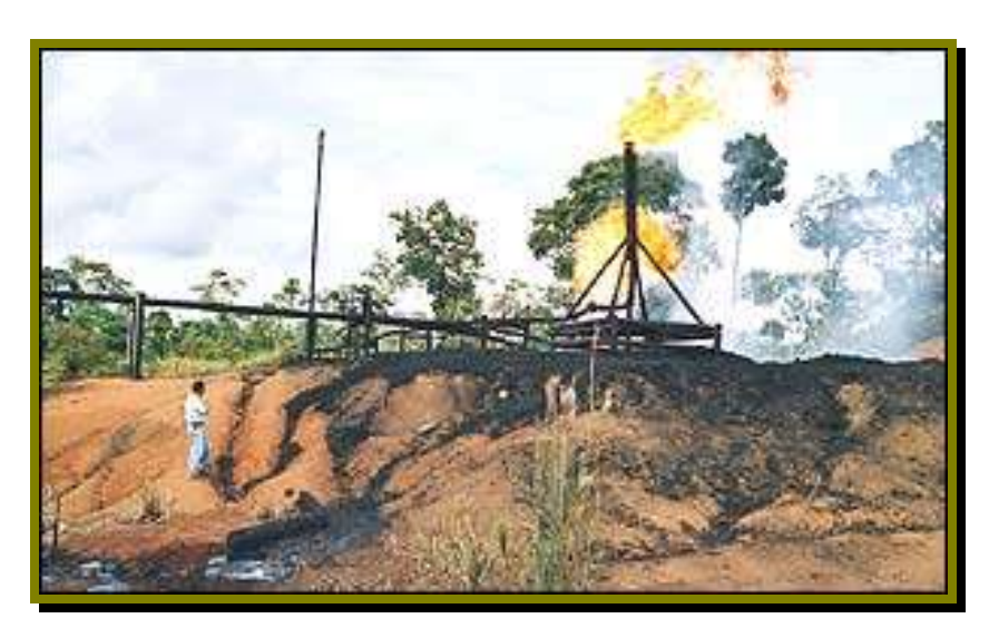
Constant oil spills in the Ecuadorian woods.

In February 2003, Amnesty International and Sierra Club presented a new report called Environmentalists Under Fire: Six Urgent Cases of Human Rights Abuses <sup>43</sup>, in which it manifests: