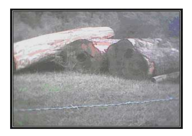
Indiscriminate felling of native Chilean woodland