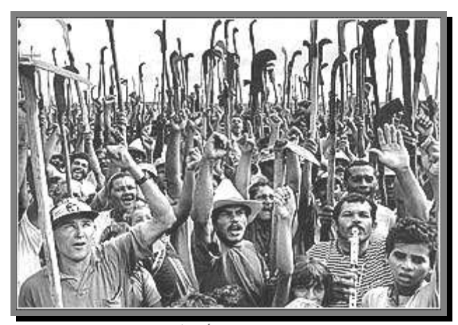
Fundación Auna. 2000 Colabora Eastman Kodak Company

In a recent report entitled "State of Conflict", Greenpeace denounced the situation of the Brazilian Amazonian state of Pará, where forestry activities and cattle ranches are the main destructive forces behind the illegal occupation of land. "As in many other areas of the Amazon, the environmental problems in Pará are frequently associated with situations of social injustice. Pará is the Brazilian state with the highest index of assassinations related to conflicts over the ownership of land, and these are rarely investigated", states the ecological organization in its report.<sup>20</sup>